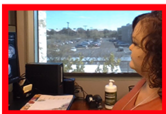
✗ Unacceptable Side-View

Cannot see entire monitor or entire workspace