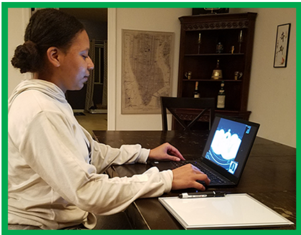
✓ Acceptable Side-View