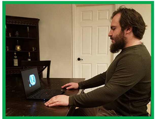
✓ Acceptable Side-View