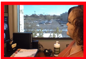
✗ Unacceptable Side-View Cannot see entire monitor or entire workspace