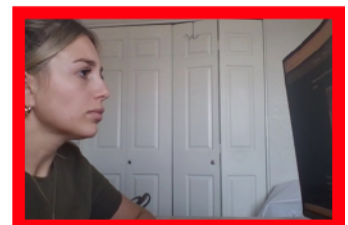
Cannot see workspace